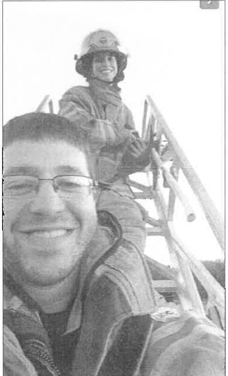
Training on the ladder truck with a local officer.