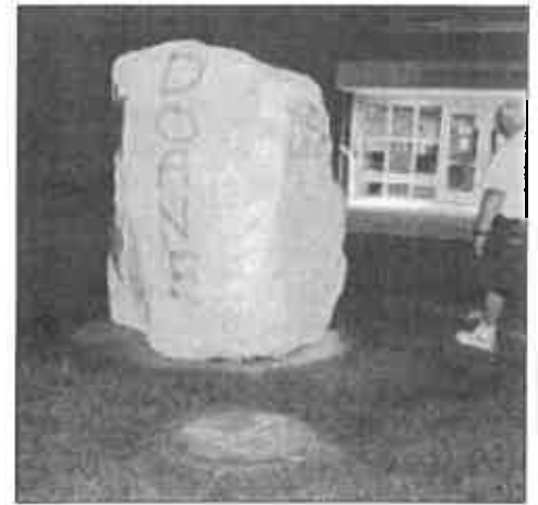
We took over the graffiti rock that was just outside of our residence hall. Groups visiting SVSU are encouraged to make their mark on the rock.

of these were terrific!! Everyone seemed to enjoy the food at SVSU's "Marketplace at Doan." Quite a variety of food! We can't forget the Doane "Book Store" from Doane College. What a fun time as always going to shop!!! The banquet on Friday night was exceptional! The