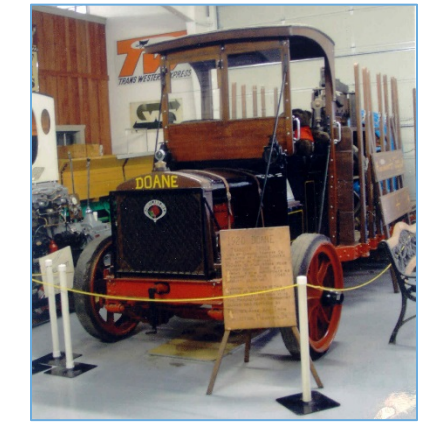
Truck Museum Near Portland, OR

The Doane Motor Truck Company in 1916 in San Francisco, California with their first model being a 16 horsepower four-cylinder Waukesha engine using a double chain drive and low frame design. The first trucks were rated at 6-tom capacity but cargo weighing four times that was commonly loaded along the piers. These trucks featured low stake-side flatbeds for loading and unloading ships dockside at a time when forklifts were not available.